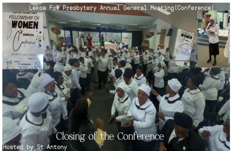
Lekoa Fow Presbytery Annual General Meeting (Conference)