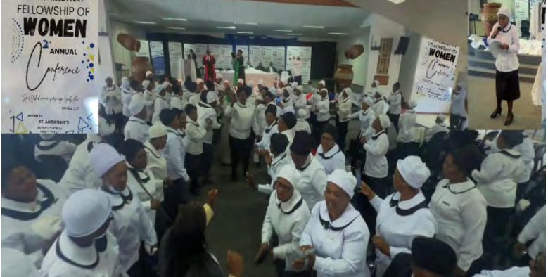
Closing of the Conference