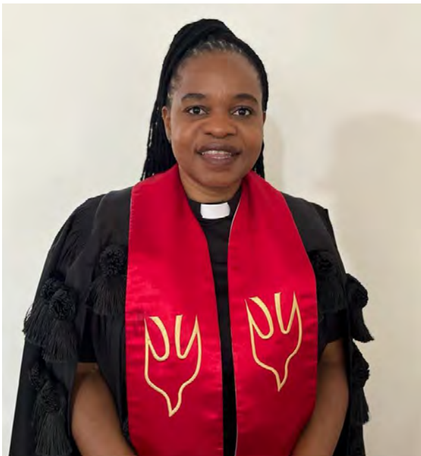
Rt Rev Lydia Neshangwe: Moderator of General Assembly

YOU HAVE THE POWER! Exodus 1:15-21 (Shiprah and Puah)